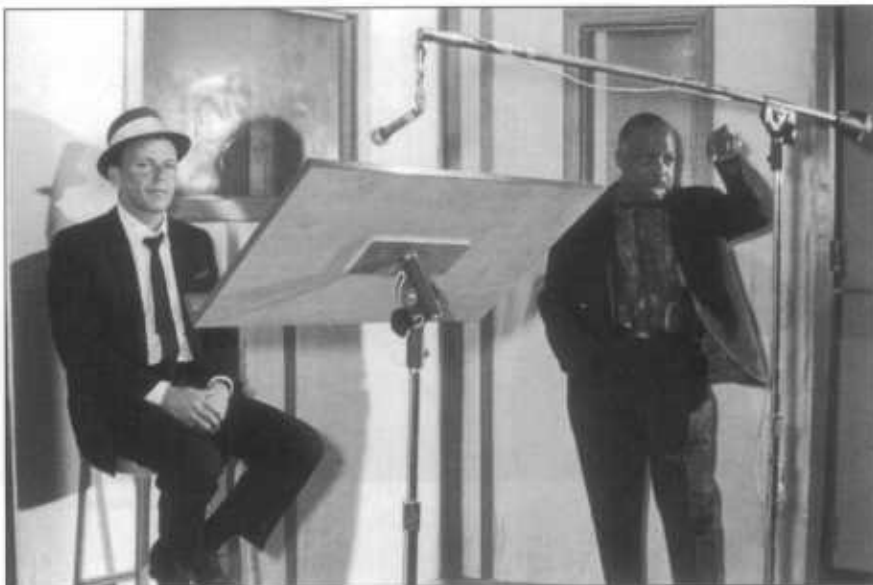
Frank Sinatra with Count Basie, October 1962. From the Collection of Charles Granata.