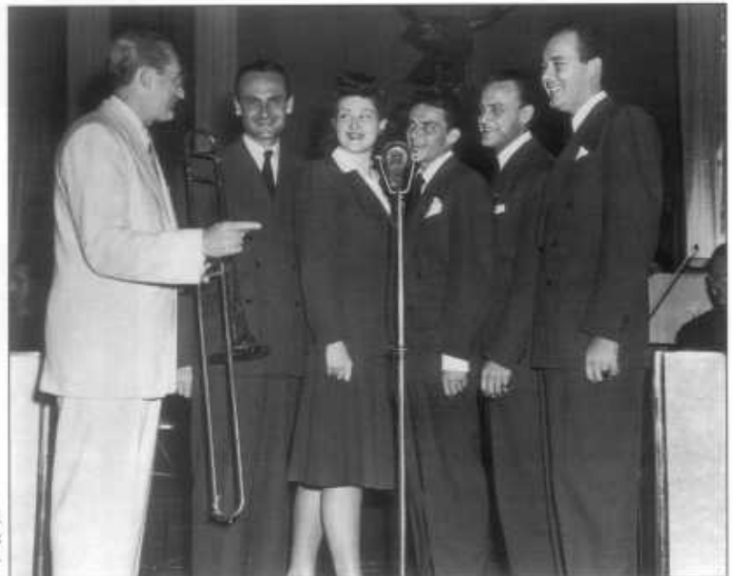
Frank Sinatra with the Tommy Dorsey Orchestra, Jo Stafford and the Pied Pipers, 1940; Hotel Astor, New York, New York.