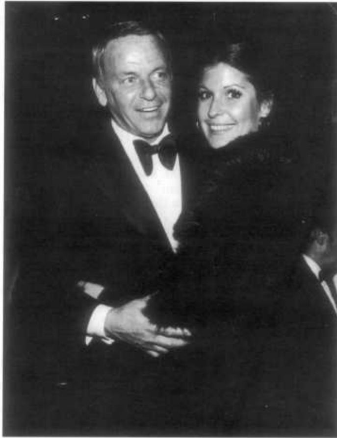
Frank Sinatra and Tina Sinatra.