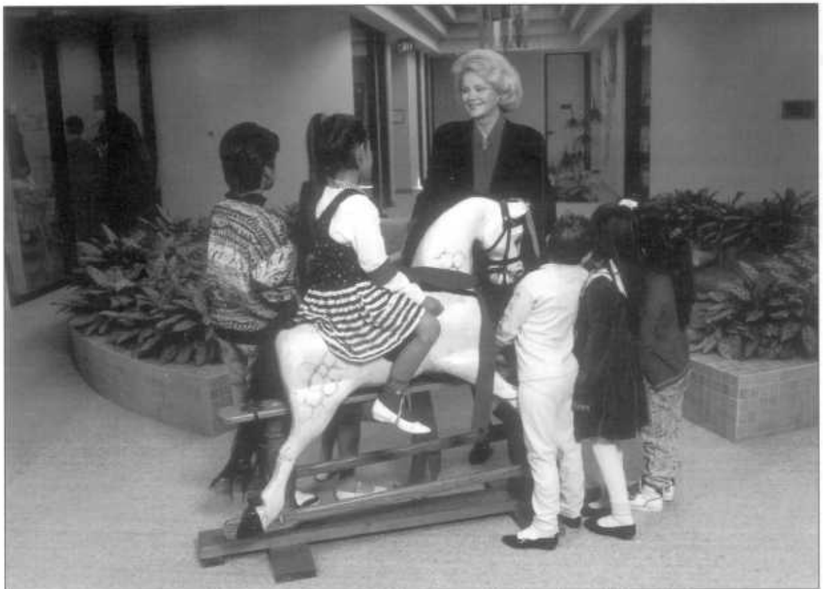
Barbara Sinatra at the Barbara Sinatra Children's Center.