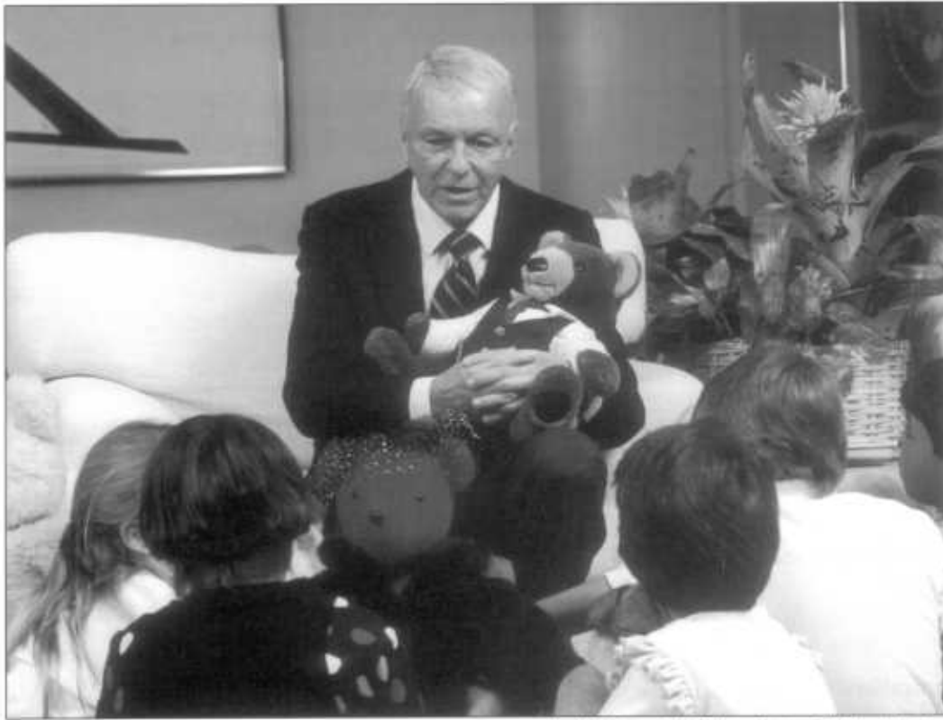
Frank Sinatra at the Barbara Sinatra Children's Center.