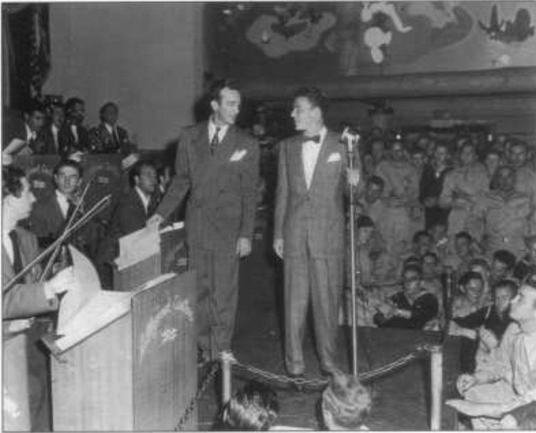
Frank Sinatra with the Harry James Orchestra at the Hollywood Canteen during World War II.